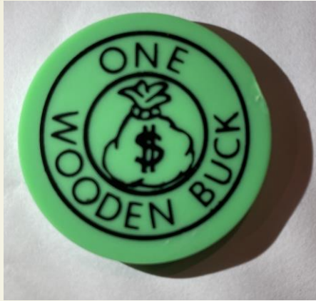
SNAP TOKENS GREEN $1 AND $2