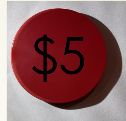
CASH VALUE TOKENS RED $5