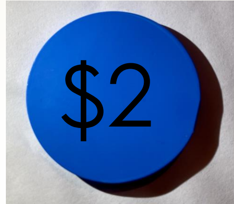
DOUBLE SNAP TOKENS BLUE $1 AND $2