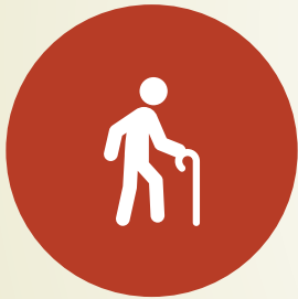
MISSOULA AGING SERVICES