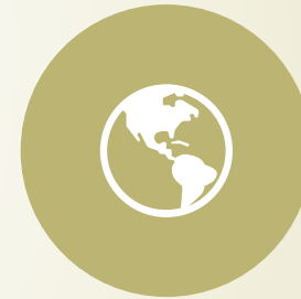
ZERO BY FIFTY