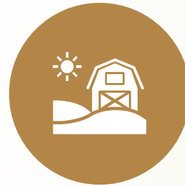
COMMUNITY FARM AND AGRICULTURE (CFAC)